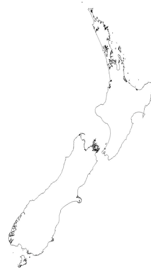
Fig. (2). Area boundaries used in Table 1.

Actual catches are much higher than these PBRs. Area E has had the best observer coverage. Based on dolphin catches observed by independent observers on fishing boats it has been estimated that an average of 28 Hector's dolphins per year were caught in this area during 2000-2006 [20]. This is on the order of 60-140 times the PBR for this area.